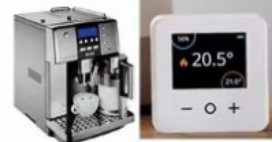
Smart Home Products