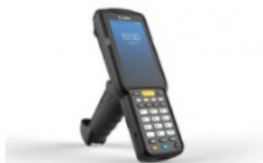
PDA & tablet