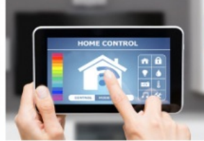
smart home& white goods