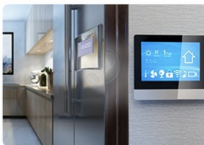
Smart Home color LCD modules with