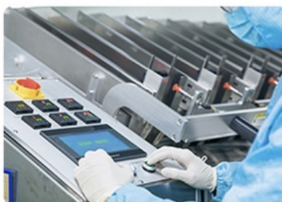
Manual control device