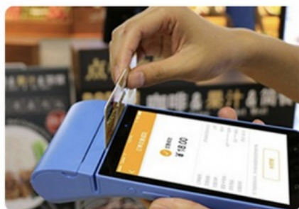
POS & PDA LCD touch display

Small LCD Touch Screen, branded Chenghao Optoelectronic, model CH101WX05A-CTB, is produced in China Shenzhen, and certified with RoHS, CE and FCC. The minimum order quantity is NO MOQ, and the price varies. All the products are packed in right way to keep it safe. For small sizes of products, tray and carton are used, and for bigger sizes, foam slot and carton are used. Besides, packages can be designed according to customers' requirements. The delivery time is 3 to 7 days. The payment terms is TT, and the supply ability is 300K pcs/month. The weight of this product is TBG. The resolution of this product is 800*1280 pixels, and the size is 10.1 inch. The outline size is 204*309*5.53 mm, and the brightness is 500cd/m 2 . It is perfect for small touchscreen LCD, small LCD monitor, small LCD monitor screen, small LCD display monitor, small LCD touchscreen monitor applications.